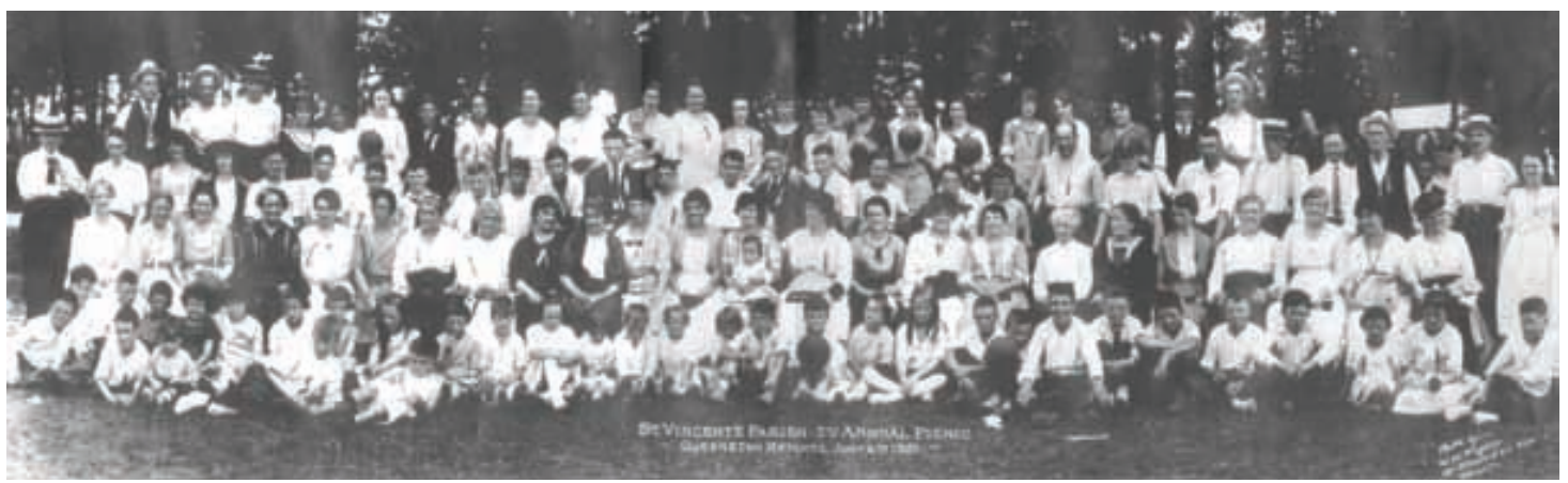
Photo: St. Vincent's Parish, 5th Annual Picnic, Queenston Heights, July 6th, 1921 (See the original in the vestibule)